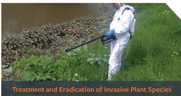
Treatment and Eradication of Invasive Plant Species