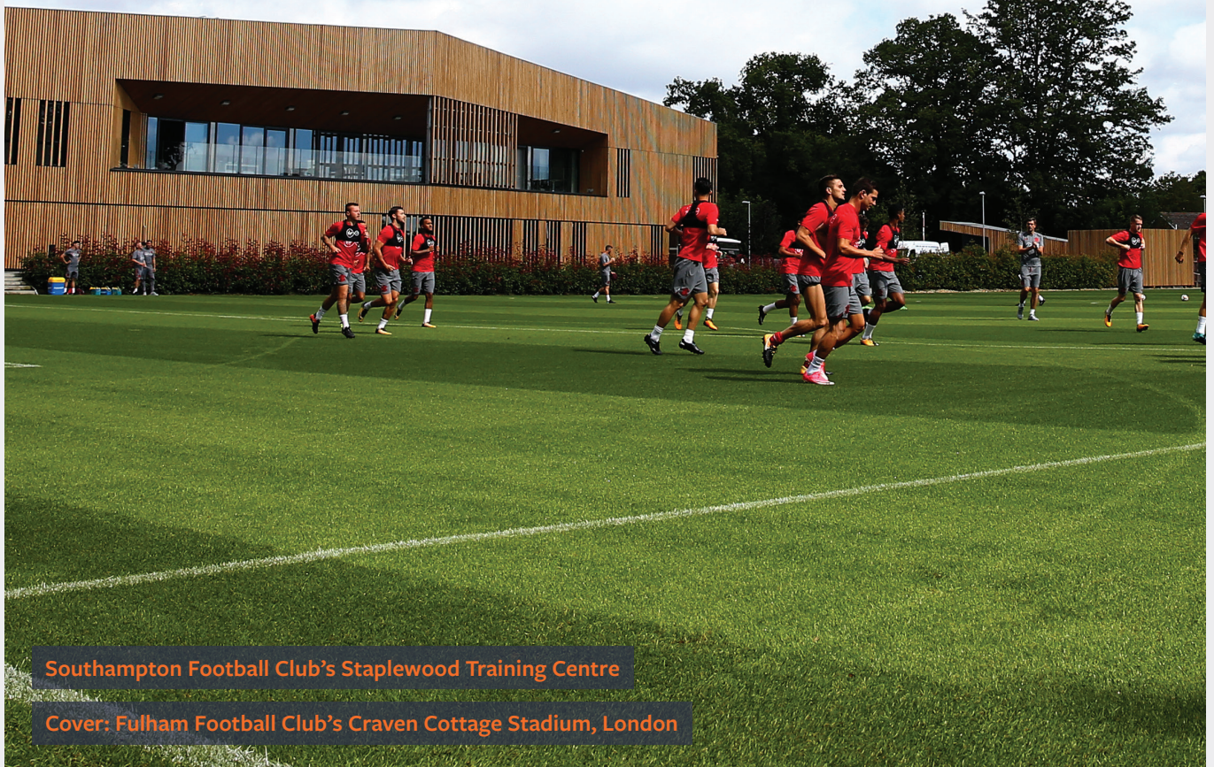
Southampton Football Club's Staplewood Training Centre