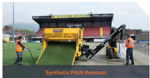
Synthetic Pitch Removal

Soil, Sand/Soil mixes, Fibresand mixes, Rootzones, Cricket Loams