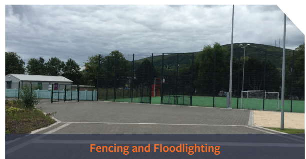
Fencing and Floodlighting