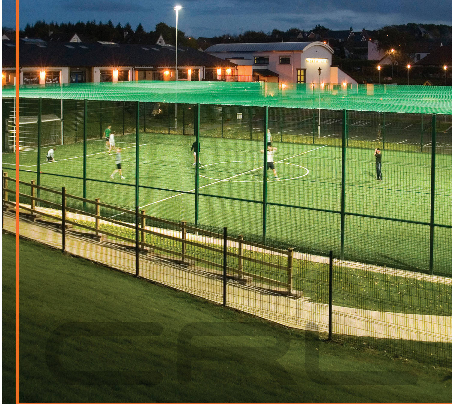
MUGA at Windmill PS, Dungannon