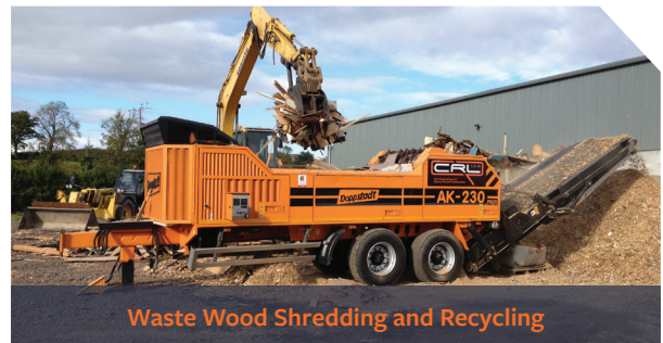
Waste Wood Shredding and Recycling