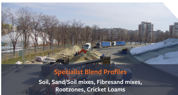
Specialist Blend Profiles

Soil, Sand/Soil mixes, Fibresand mixes, Rootzones, Cricket Loams